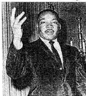
Martin Luther King, Jr.

Church Offices will be closed in recognition of this special holiday.